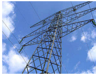
Figure 4.2. High voltage power lines are used for the transmission of electricity over long distances.

The electrical transmission system is used in combination with power plants, distribution systems, and sub-stations to form what is known as the electrical grid. The grid is designed to meet all of society's electricity needs, and is what gets the electrical power from its beginning to its end use. Since power plants are most often located outside of densely populated areas, the transmission system must be large.